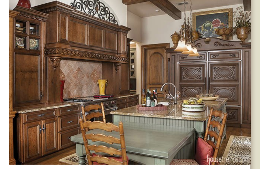
It is easy to find a comfortable place to eat in this home. The kitchen features rich dark wood cabinetry around the perimeter, an olive green center work island, and an attached table and chairs for easy kitchen snacking. The only major change in this space was the adornment of the built-in refrigerator panels with carved Enkeboll onlays to add a sense of uniqueness to the space.