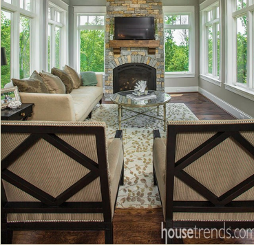
Beam me up