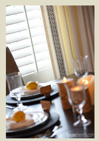
It's all Greek to us!