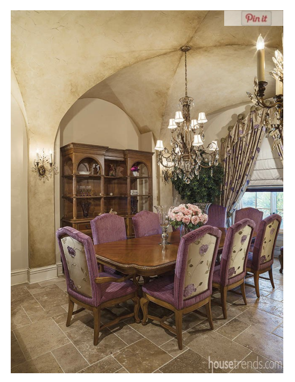
Nearby, overlooking the back yard is a casual dining area with seating for six. For more dressy events, this home also features a formal dining area with textured walls and a spectacular groin vaulted ceiling. The lush gold and purple upholstered chairs and drapery add a touch of bling to this space.