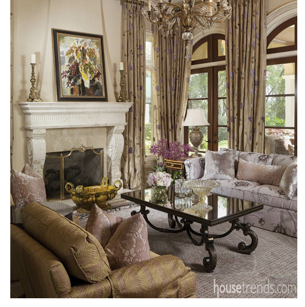
fabrics setting the tone. "The living room is furnished with floor to ceiling Etamine silk custom drapery and Council tuxedo style sofa and chairs along with an EJ Victor French chair," Marksberry says. Council end tables, a silk Persian rug and a dramatic Fine Art chandelier complete the room. The large limestone fireplace helps give the space a truly old world feel.