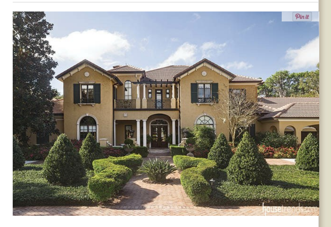
Written by: Amy Diehl

Brilliant pops of color and luscious fabrics in stripes and patterns, plus close attention to detail, are the defining hallmarks of the beautiful LoScalzo residence located in Stillwater, a small private development of elegant homes situated in Odessa. This gorgeous lakefront villa features 8,565 square feet of living space with a total of 11,000 square feet under roof. In addition to both the latest in energy efficiency and smart home technology, as well as the finest craftsmanship, it's the attention to detail and elegant finishes that complete this home.