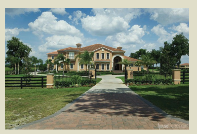
Home remodel with all the right moves