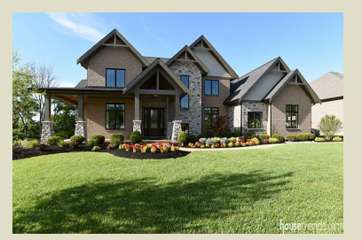
4: The Gables of Woodford by Homes By Gerbus, Inc.