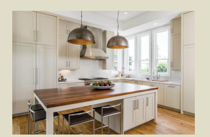
Statement lighting takes center stage