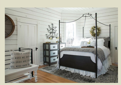
You don't know ship(lap)