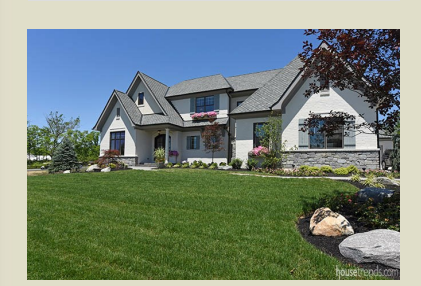
7: The Jefferson by Sterling Homes