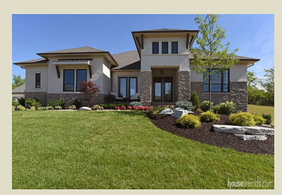
6: The Sebastian by Drees Homes