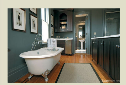
Careful renovation brings history back to life