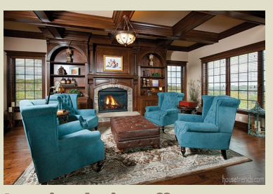
Interior design offers Southern charm