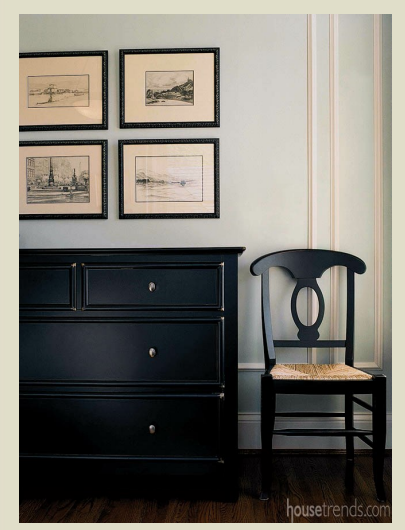
Historic home renovation reveals a diamond in the rough